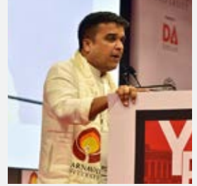
Shri Harsh Sanghvi Honourable MoS for Home, Sports, Youth Service and Cultural Activities, Government of Gujarat