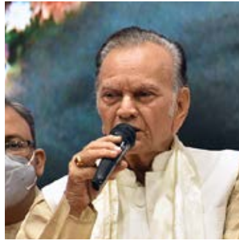
Shri Shahbuddin Rathore (Padmashri in Literature and Education)