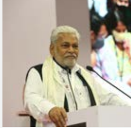
Shri Parshottam Rupala Honourable Union Minister for Fisheries, Animal Husbandry and Dairying

The key speakers during the first session were :