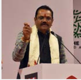
Shri Jitubhai Vaghani Honourable Minister of Education, Higher Education, Science and Technology, Government of Gujarat