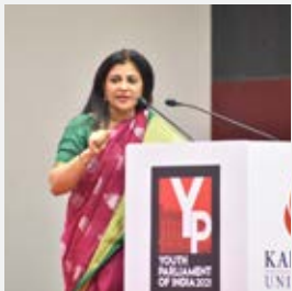
Ms. Shazia Ilmi National Spokesperson, BJP