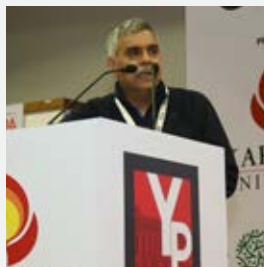
Shri Sandeep Dikshit Spokesperson, Indian National Congress