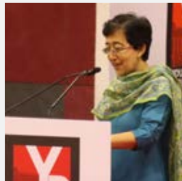
Ms. Atishi Marlana Honourable MLA of the Delhi Legislative Assembly