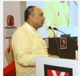
Shri Brijesh Kalappa Advocate, Honourable Supreme Court of India