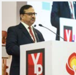
Shri Vijay Sardana, Advocate Honourable Supreme Court of India, NGT and Delhi High Court