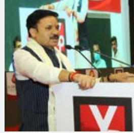
Shri Devusinh Chauhan Honourable MoS – Communications, Government of India