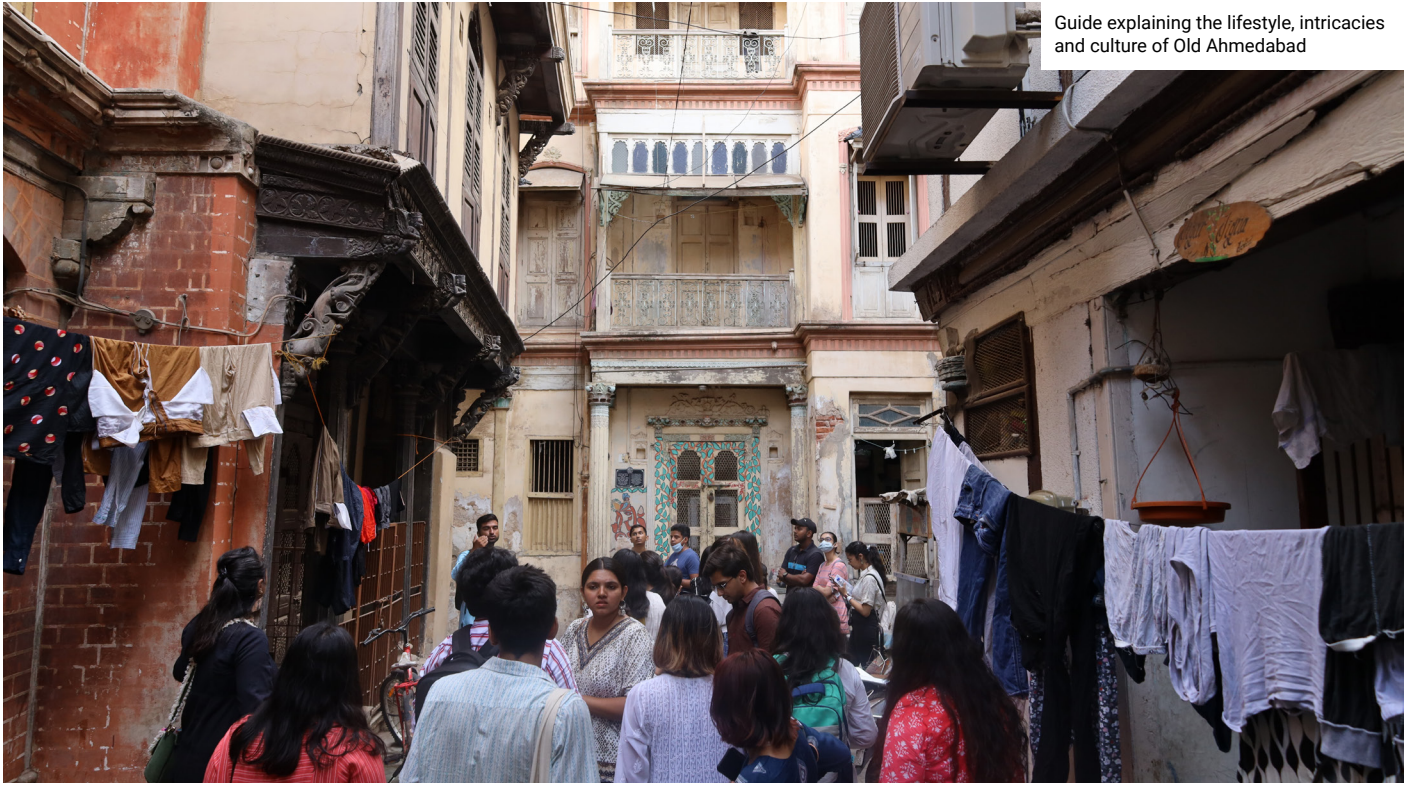
Guide explaining the lifestyle, intricacies and culture of Old Ahmedabad