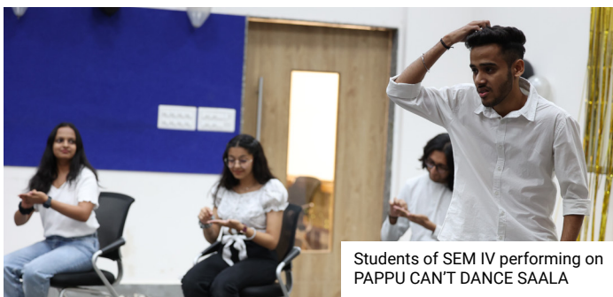
Students of SEM IV performing on PAPPU CAN'T DANCE SAALA