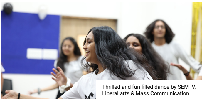
Thrilled and fun filled dance by SEM IV, Liberal arts & Mass Communication