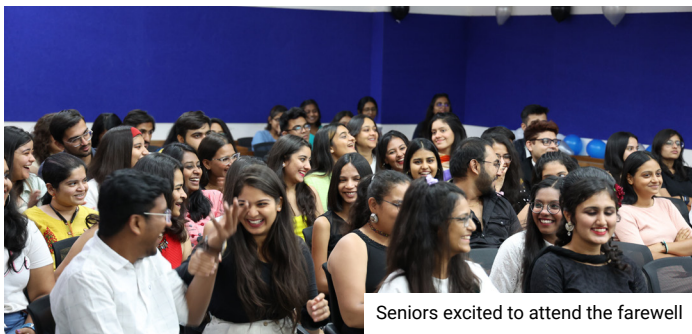
Seniors excited to attend the farewell