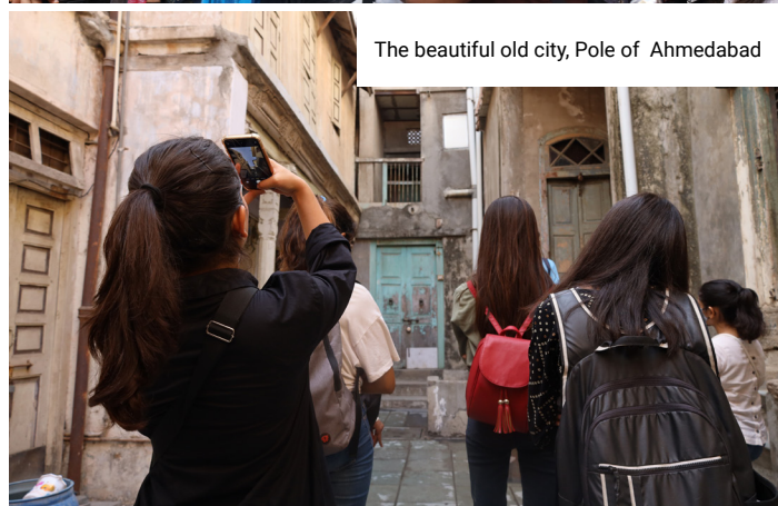
The beautiful old city, Pole of Ahmedabad