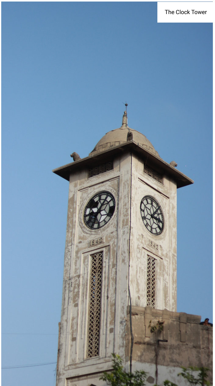
The Clock Tower