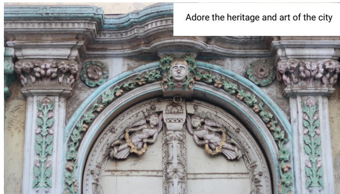
Adore the heritage and art of the city