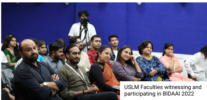
USLM Faculties witnessing and participating in BIDAAI 2022