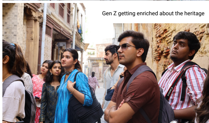
Gen Z getting enriched about the heritage