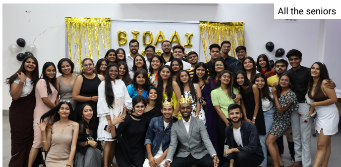
All the seniors