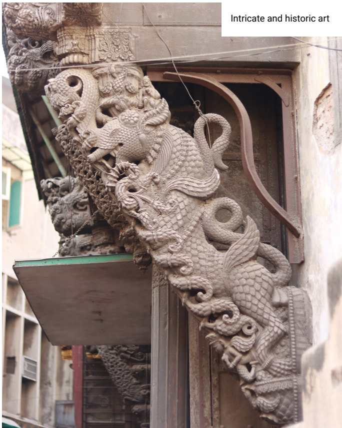
Intricate and historic art