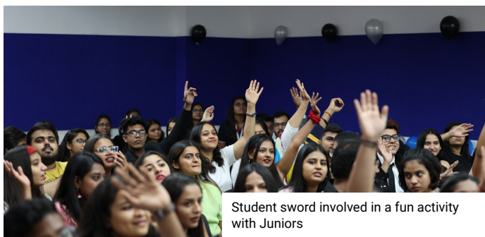
Student sword involved in a fun activity with Juniors