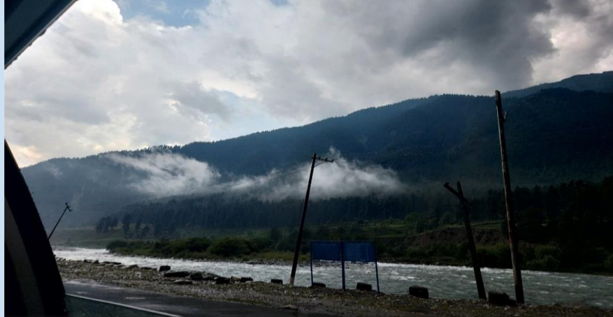
Pahalgam (Mini Switzerland)– Village of Shepherds (Jammu & Kashmir)

“IF THERE IS HEAVEN ON EARTH, IT IS HERE, IT IS HERE”