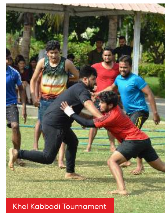
Khel Kabbadi Tournament