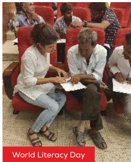
World Literacy Day

Compassion is what makes us human, and holistic humans is what we all need to be. Augmenting our education spectrum with a CSR ecosystem-Heal the World Foundation. A foundation guided by us and run by students. An initiative aimed at a holistic development of students, where students and we come together to make a difference. Our Aim: Do Good. Spread Smiles. Change the World, One Selfless Act at a Time.