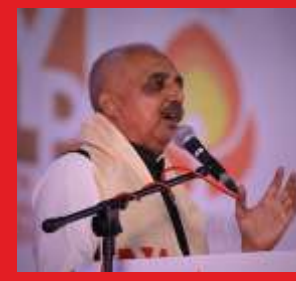
Shri Akhilesh Pratap Singh National Media Panellist, Indian National Congress