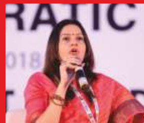
Ms. Priyanka Chaturvedi National Spokesperson, Indian National Congress