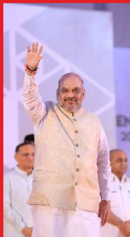
Shri Amit Shah - National President, Bharatiya Janata Party,