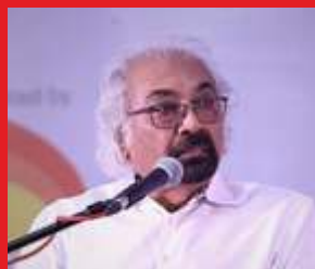
Shri Sam Pitroda - Father of Indian Telecom Revolution