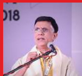
Shri Pawan Khera Senior Leader, Indian National Congress