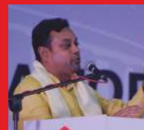
Dr. Sambit Patra National Spokesperson, Bharatiya Janata Party