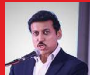
Col. Rajyavardhan Singh Rathore, VSM (Retd.), Hon'ble Minister of State (I/C) for Youth Affairs & Sports and Information & Broadcasting, Govt. of India

Humanizing Health-A national symposium on public health, human rights, and law