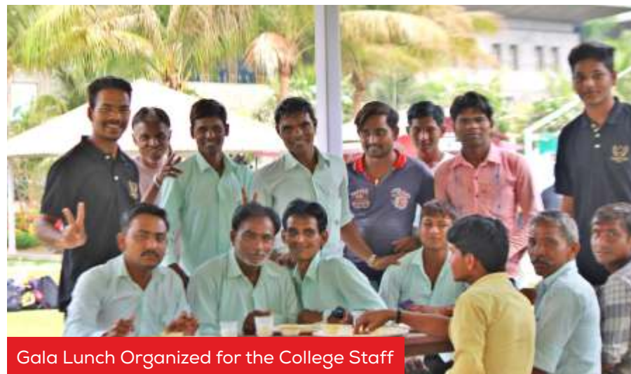
Gala Lunch Organized for the College Staff