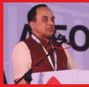
Dr. Subramanian Swamy Member of Parliament, Rajya Sabha