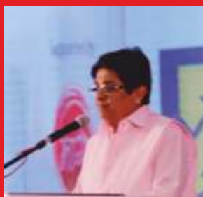
Dr. Kiran Bedi - Hon'ble Lt. Governor of Puducherry

Our students are at the center of all our activities. We believe holistic education as beyond textbooks and lectures in classroom. Therefore, we encourage students to take up projects and participate in various events, which instills confidence in them and prepares them to brave challenges in future.