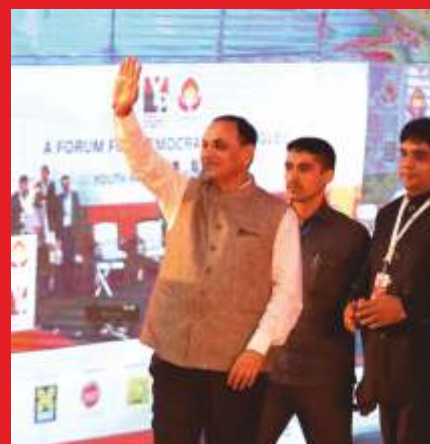
Shri Vijay Rupani Hon'ble Chief Minister, Gujarat