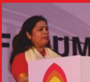
Smt. Meenakshi Lekhi Member of Parliament, Lok Sabha